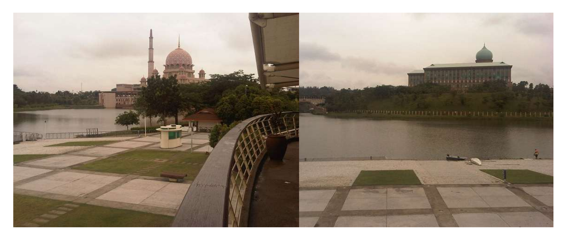
Putrajaya's iconic City Mosque