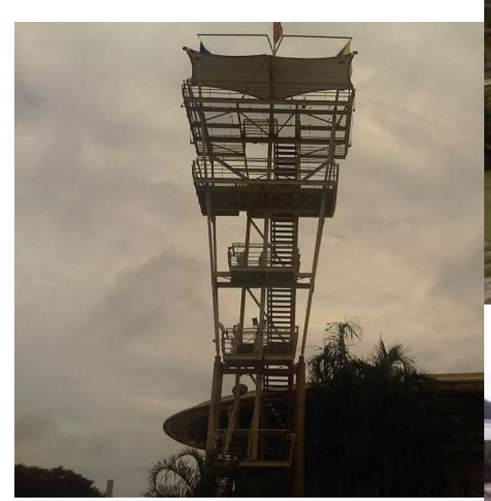
Kelab Tasik's Club House & Control Tower