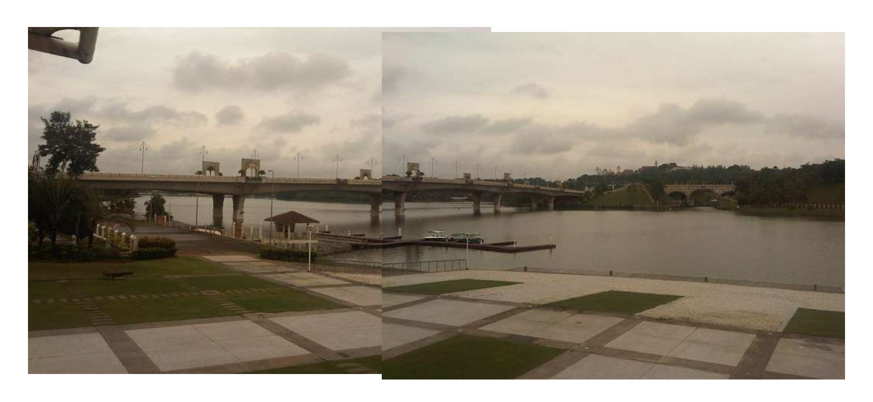
High density traffic across one of 7 Putrajaya bridges means greater exposure